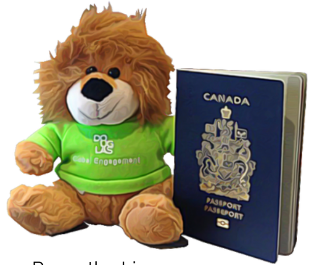
Roary the Lion Douglas College Mascot

We are looking forward to welcoming you at Douglas College!