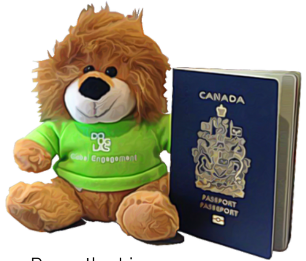
Roary the Lion Douglas College Mascot

We are looking forward to welcoming you at Douglas College!